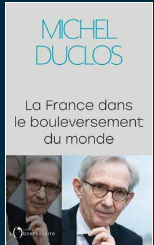
France in the midst of global upheaval, Michel Duclos, Editions de l'Observatoire, 2021.

Second, making sense of the new global “mental map” in a world where alliances are less reliable, the transactional way prevails, peace is no longer the horizon of our defense strategy 2 and where it is vital that geoeconomics are articulated with geopolitics. By tracing the thread of a foreign policy that we would now have dropped, we are reminded that its most