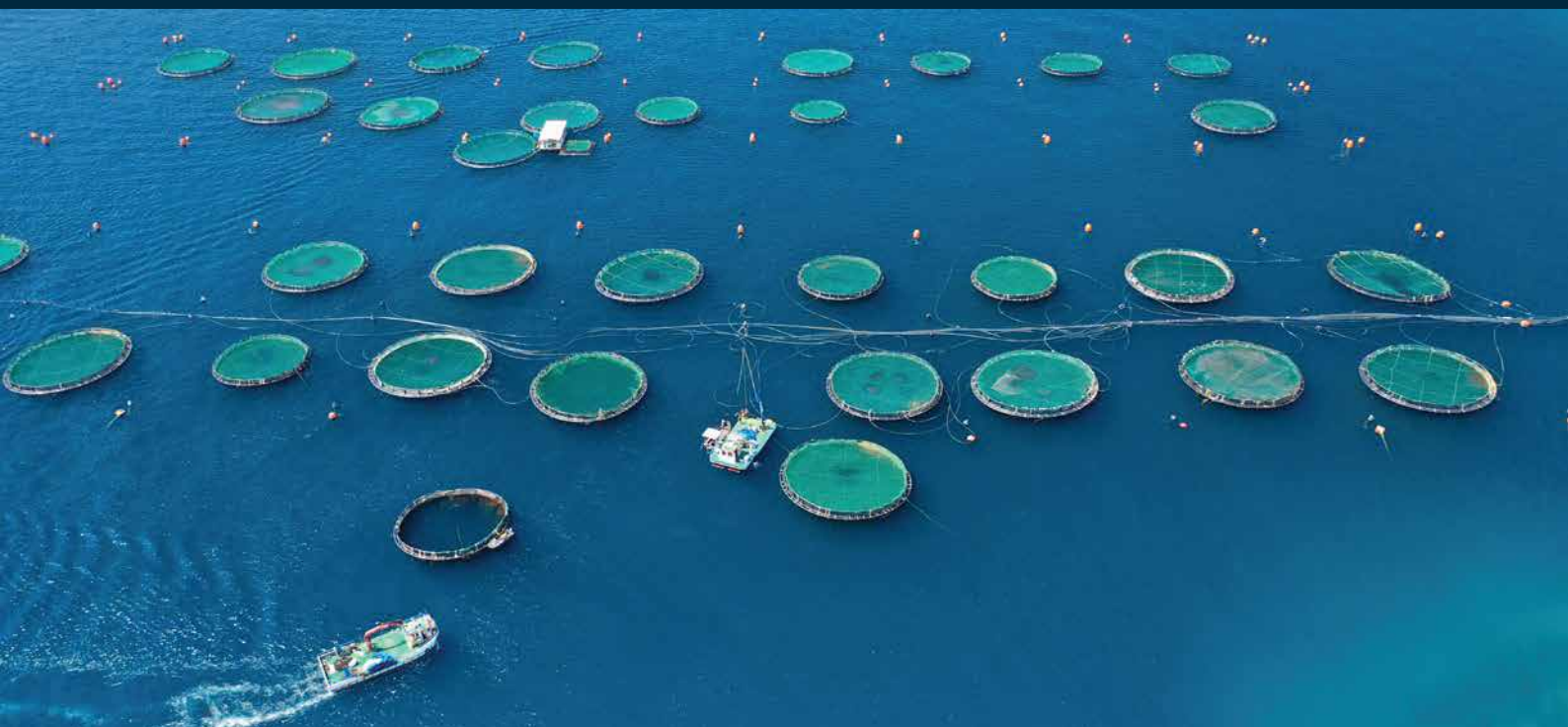
Fish farms off the Tunisian coast