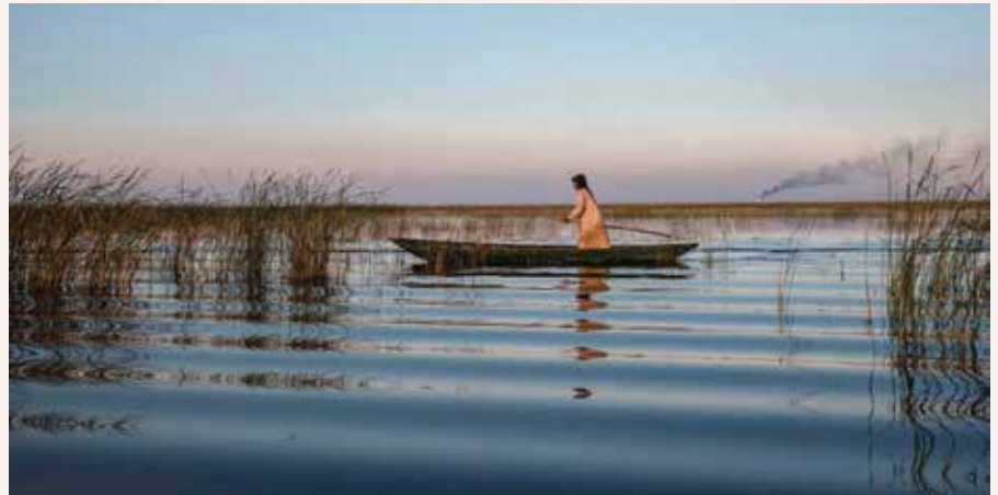
Mesopotamian marshes, South East Iraq.

In this perspective, the Iraqi Ministry of Water Resources has organised in March