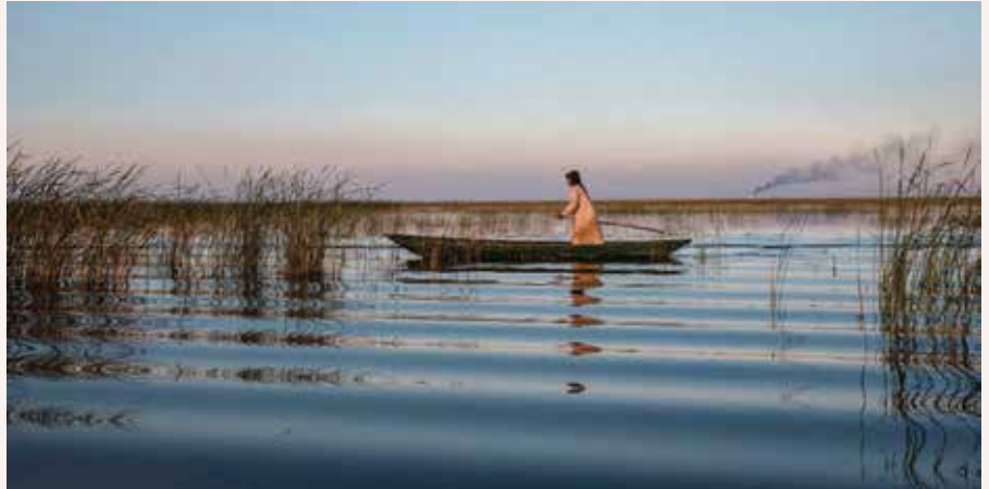
Mesopotamian marshes, South East Iraq.

In this perspective, the Iraqi Ministry of Water Resources has organised in March